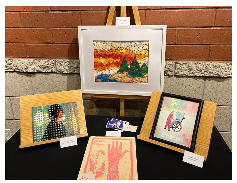
Many ages and mediums were represented in Love First UMC's Art Crawl on March 20th!