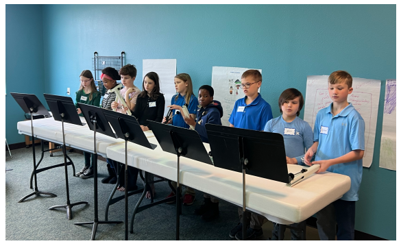
Quest Chime Choir during rehearsal!